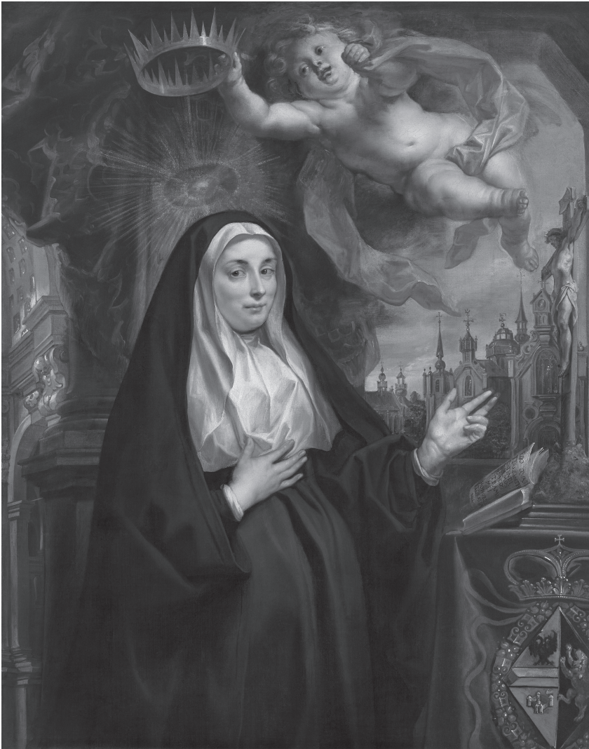
Jacob Jordaens, Portrait of the Infanta Isabella Clara Eugenia as a Nun , c. 1635. American Private Collection, Courtesy of Agnews Gallery, London.