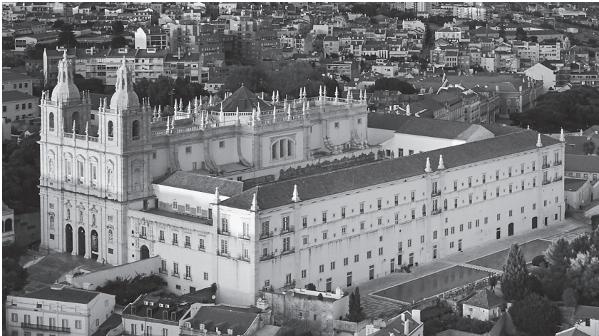
Fig. 8.2. Church and Convent of Saint Vincent, Lisbon. 2017.