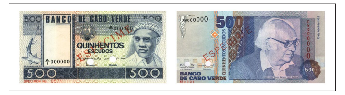
Figure 2. A 1977 banknote with Amílcar Cabral and a 1992 banknote with Baltasar Lopes da Silva.

As regards the currency, this also suffered a process of 'de-Africanization' like other national symbols, as Rego (2015: 77) aptly argues. The notes and coins bearing the image of Cabral and other African revolutionaries were gradually removed from circulation during the 1990s and replaced with motifs of local fauna and flora and effigies of other personalities from the islands (Figure 2). Dating from before the African nationalists, these figures also began to constitute the new basis for citizens to be honoured, more in keeping with the new values of the nation. They were all men from the Creole elite who, despite having been critical of the subaltern status of the Cape Verdean in the archipelago, had not explicitly advocated anticolonialism, Africanness or the independence of the islands. The new iconographic option for the national currency demonstrates how the 'dilution of Africa' (Fernandes, 2002) operated alongside the devaluation of the anticolonial legacy and the de-Cabralization of the national symbols.