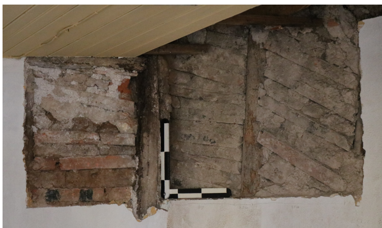
Figure 3: Coimbra's "medieval house" (survey 12)

With their extremities cut into triangles, 'fishtail' bricks make a perfect joint with wooden props, producing practical, lightweight and flexible walls. Their appearance in Portuguese construction has therefore been informally associated with the Pombaline reforms in downtown Lisbon, although in actual fact there are no studies that confirm or deny this. In Coimbra, where this material frequently appears in demolitions for urban restoration, few attempts have been made to attribute a chronology to it. Nonetheless, during the restoration of the Colégio da Santíssima Trindade, in the upper part of the city, a structure with this type of brick was discovered which was dated between the end of the 16th century and the middle of the 18th century. 23 In building work on Rua Fernandes Tomás, partitions with 'fishtail' bricks were found, built between the 18th and 19th centuries. 24 While downtown, in Rua Direita, the gable of a demolished building, probably dated to between the 18th and 19th centuries, was built entirely with these bricks. 25