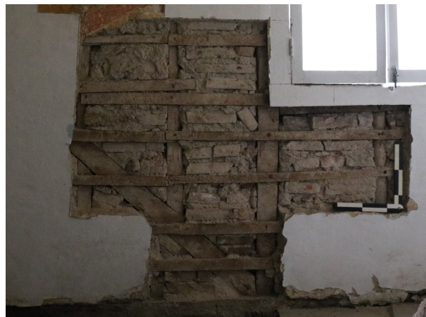
Figure 2: Coimbra's "medieval house" (survey 1)

Notwithstanding what could be seen of the building arrangements via the archaeological surveys, it was not possible to fully examine the architectural complexity of Coimbra's "medieval house". The advanced state of degradation and inaccessibility to certain areas, 9 in addition to the changes brought about by recent renovations, limited the potential interpretation of the archaeological data. A proper archaeological analysis was thus required for an adequate architectural assessment, encompassing the building, materials and construction systems in their appropriate historical-artistic context.