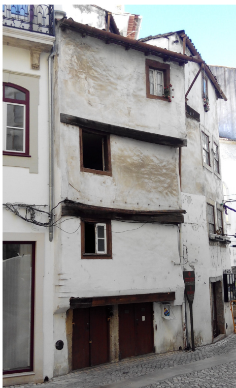
Figure 1: Coimbra’s “medieval house”

Late medieval Portuguese cities were deeply ruralised and accommodated for the demographic growth of the 12th and 13th centuries. They were not infrequently limited by walled ramparts and their growth was compressed and essentially outdoor. 8 The street was a natural extension of life and trade, and was both the antechamber of the house and the extension of work.