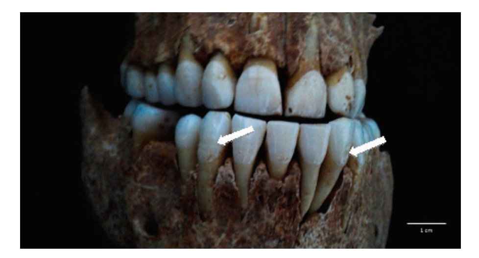
Figure 1. Linear enamel hypoplasia on the dentition of a middle aged female (Sk. 483) from Shantarîn necropolis. At the right side of the jaw, the arrow shows a score 3 lesion, three visible linear groves. The left arrow indicates a score 2 lesion.

Most individuals (9/14=64.29%) presented one hypoplasic line (score 2) while five (5/14=35.71%) showed two or more lines per tooth and thus were scored 3 (Figure 1). The number of insults (scores) (p value=0.8586) was independent from the age at death.