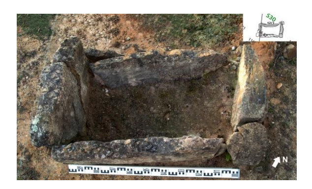
Figure 2 Small stone cist number 30 from the Necropolis of Casas Velhas (NCV).