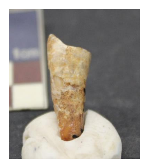
Figure 3 Labial view of tooth 33 recovered from cist 35 of NCV with pronounced oblique/distal wear.

include pronounced oblique-distal wear on anterior (n=6; Figure 3) and posterior teeth (n=2; Figure 4; Table 1), corresponding to five individuals. Both affected posterior teeth belong to the same individual but are also the only preserved teeth from this skeleton. Another unusual wear pattern was observed in two anterior teeth preserved from the adult of unknown sex unearthed from cist 10. The lower left central incisor shows the removal of a large area of enamel in its labial surface (Figure 5). The upper right central incisor exhibits a groove running in mesio-distal direction associated with a severe lingual wear (Figure 5). The remaining five posterior teeth of this skeleton display dental wear between grades 2 and 4. So, atypical dental wear was observed in 26.1% (6/23) of the anterior teeth and 2.98% (2/67) of the posterior teeth of NCV and, respectively, 3.5% (1/29) and 11.5% (7/61) of the upper and lower teeth.