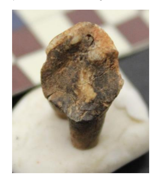
Figure 4 Severe oblique wear observed in tooth 37 exhumed from cist 33 of NCV.

nibbling effect on his occlusal surface besides a chip on its mesio-incisal edge.