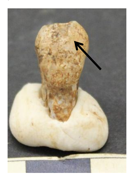
Figure 6 Chipping in the labial surface of tooth 23 unearthed from cist 2 of NCV.

which was not possible due to their low preservation and isolated nature.