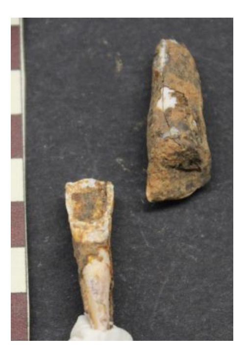
Figure 5 Teeth 31 (labial view) and 11 (lingual view) recovered from cist 10 of NCV. Note the removal of the enamel of labial surface of 31 and the severe wear and the medial-distal groove of 11.