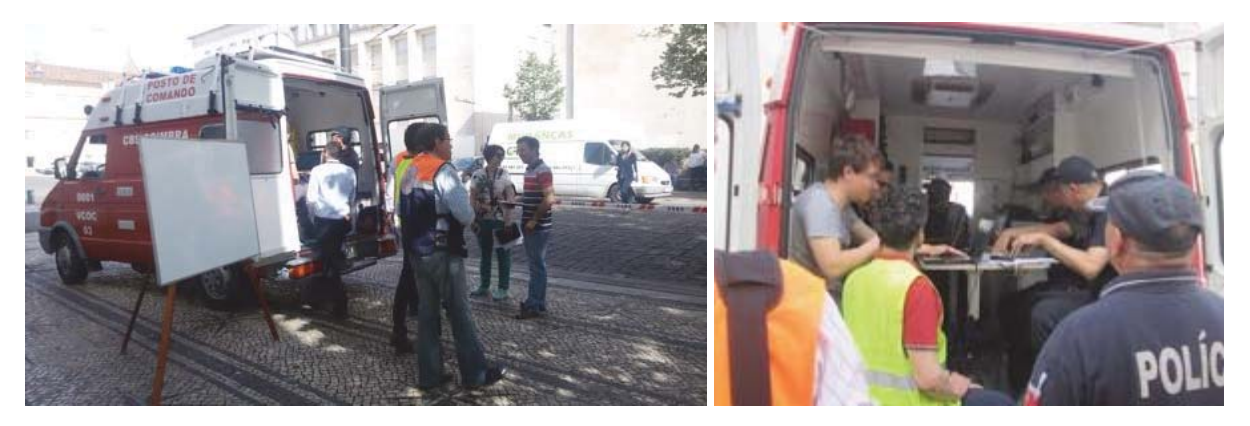
Figure 4. The site command centre

The alarm call was made at 10am (real time) through the European common emergency telephone number (112). The defined mechanisms to start the means of assistance were followed and the Professional Corporation of fire-fighters was contacted. Due to the seriousness of the occurrence, a site command centre (SCC) was set up for the control of all fire brigade operations (Figure 4). Such SCC consisted of a senior fire officer (who played the role of site commander), two fire-fighters (the site commander's assistants), and three crowdsourced information operators (all three, training school participants) – two of them received and processed information reported by volunteers using the KoBo application and one operator dealt with the data collected with the Hydra application. The process of "information reception, information processing, and actions" was operated at SCC following a "triangular" structure illustrated in Figure 5.