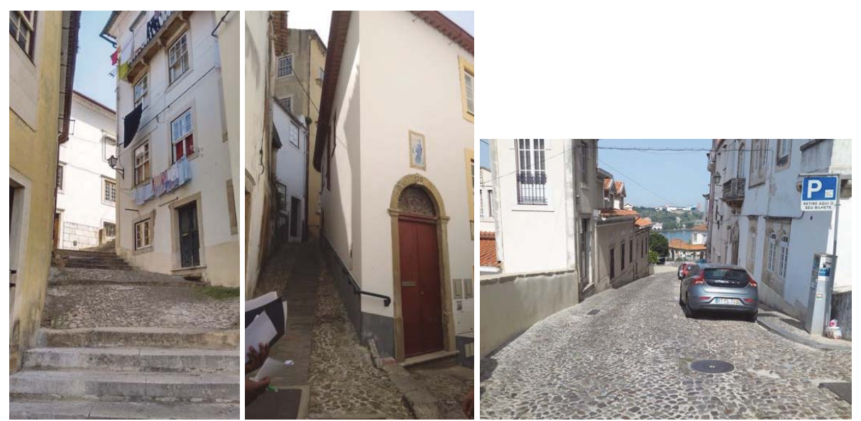
Figure 1. Images of the exercise location (the "Alta" neighbourhood in Coimbra)

Brigades, two police forces, namely the Police for Public Security (PSP) and the Municipal Police, and the safety office of UC.