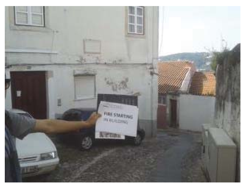
Figure 3. Assistant in the simulation exercise showing a poster that indicates an event supposed to be occurring