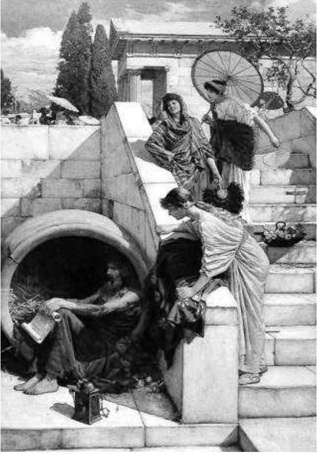
Figure 1: Diogenes from Sinope by John William Waterhouse (1905, oil on canvas - Art Gallery of New South Wales - Sydney, Australia)