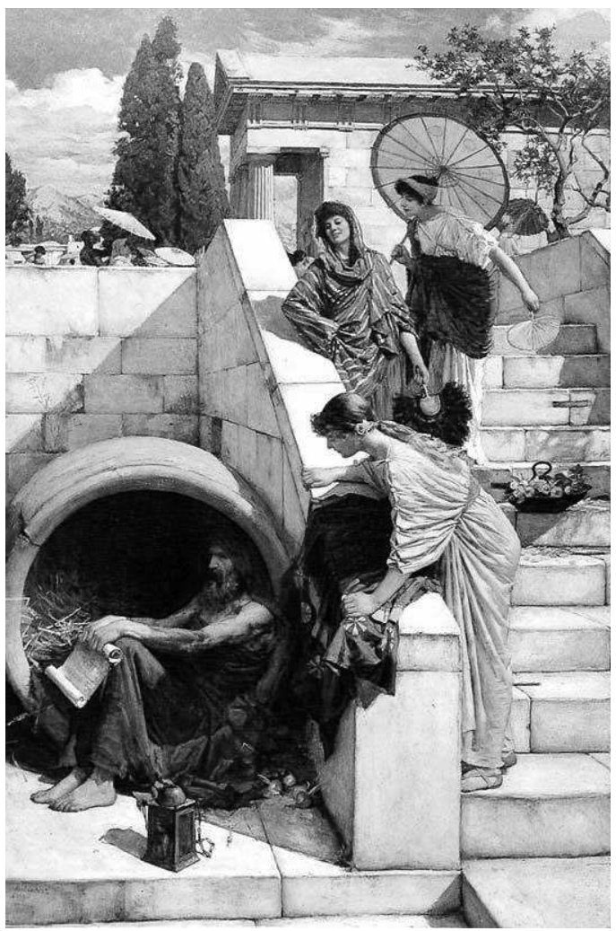
Figure 1: Diogenes from Sinope by John William Waterhouse (1905, oil on canvas - Art Gallery of New South Wales - Sydney, Australia)