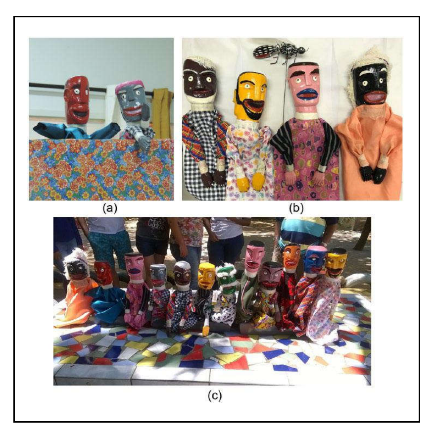
Figure 1. Wooden puppets used in manulengo theatre: (a) during a presentation of "Zé and Zika" in a school, in the semiarid region of northeast Brazil; (b) part of the characters from the "Zé and Zika" play, including a representation of an Aedes species mosquito used during the presentation; (c) the "cast" and their creators and interpreters.

Here we discuss an exploratory science communication project developed in northeast Brazil that incorporates two formats of Brazilian traditional artis-tic expressions to engage the public in questions related to biodiversity and public health: manulengo theatre and cordel literature. Manulengo theatre is a Brazilian form of puppet theatre characterized by the use of wooden pup-pets dressed in colorful textiles (Figure 1), strident voices, a small and ambu-lant folding stage, and a narrative that traditionally portraits daily-life situations in a satiric way, calling the audience to interact with the puppets