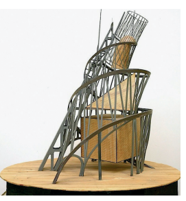
Figure 9. Contemporary model of the Tatlin Tower.