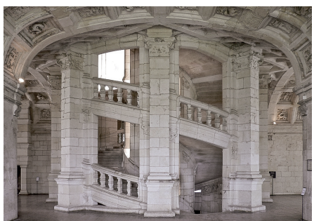
Figure 2. Leonardo da Vinci., interior stairs of the Castle of Chambord, Loir-et-Cher, France.