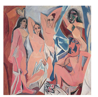
Figure 1. Pablo Picasso, Les Demoiselles d'Avignon, 1907, Museum of Modern Art, New York.