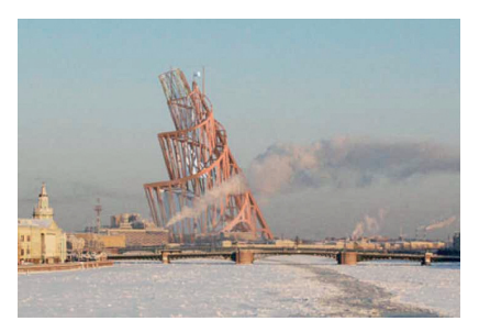
Figure 10. Photomontage with the Monument

existed a spherical cap where there was incorporated, on their axes, a projection screen and from which emerged the antenna of the radio station and their masts. In addition and to connect all these great different bodies, there were developed a set of electric elevators that adjusted to different mechanical rotational speeds facilitated the inteprenetations and ensured the proper functioning of the building.<sup>24</sup>