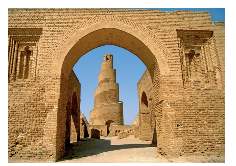
Figure 3 . Minaret of the Great Mosque of Samarra, Iraq, built in the 19th century.

program of any building. The new Russian architecture intended to be something that breaking up with the past. More than connecting with previous styles or with the production made until then, as a revolutionary movement, it had the aim of moving to the urban space the social dynamics that, admissably, signalled a beginning, the creation of a new world. For this purpose, it is explored and encouraged the relationship between the various forms of art, having a direct contagion of them all over architecture. In this context the artistic practice used all the instruments that were at its disposal by meticulous analyses, numerous trials, making the apology that at that time the art belongs to science. In that purpose, all the senses are overrated as means of excellence for the perception of the world and the geometry as knowledge and practice oriented for the rational and orderly translation of what is observed.<sup>10</sup> But, what the project of Tatlin offers, is the possibility of a complicity between the technological processes and industrial production. A reality that at the time is still not possible to implement, but that conceived potential gives people hope so convincing and credible that leads to believe that this proposal is a herald of the entrepreneurial capacity of that country with that politics.