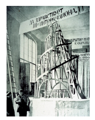
Figure 7. Model of the Monument to the Third International during the exhibition in Moscow in 1920.