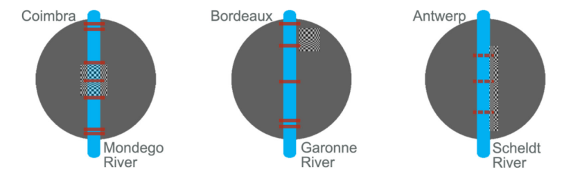
Figure 2: Spatial characterisation diagram of the three studied interventions.

It was only in the 1980s, when a system of dams and river training works were finalized, that the Mondego River lost its highly fluctuating nature, which had up to then secured large unoccupied intra-city parcels. A new stable landscape, with a permanent storage pond in the centre of Coimbra, was then the centrepiece of a regional park project, spanning both