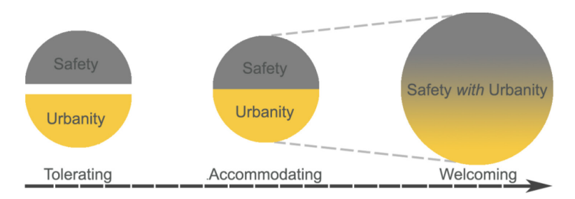
Figure 3: Different degrees of flood adaptation by design – from coexistence (left) to integration (centre) to synergy (right).