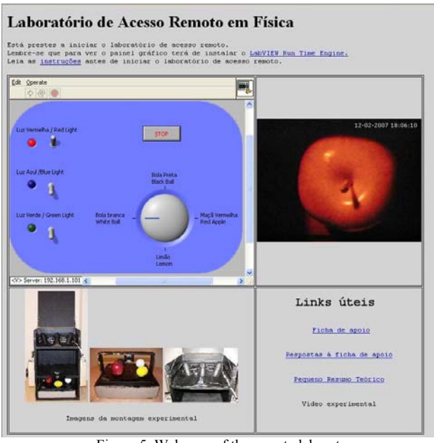
Figure 5. Webpage of the remote laboratory