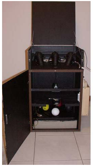
Figure 4. Experimental set-up.