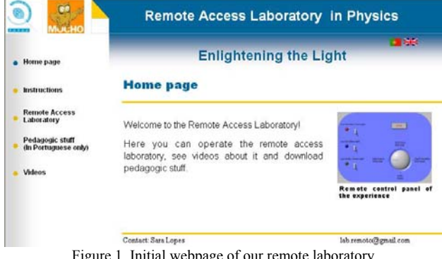
Figure 1. Initial webpage of our remote laboratory

This site contains instructions, a link to the remote laboratory, some educational materials (only in Portuguese, for the time being), and two videos: one showing the physical laboratory and the other teaching how to manipulate the laboratory.