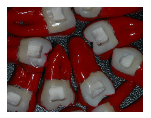
Figure 9.Application of two coats of red nail polish around restorations of group 3