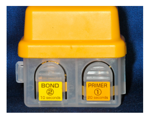
Figure 6. The self-etch adhesive Clearfil<sup>™</sup> SE Bond