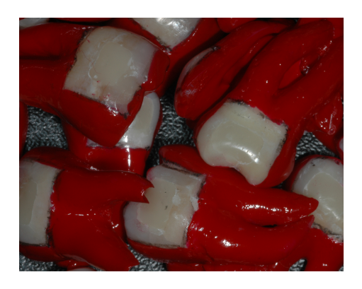
Figure 8.Application of two coats of red nail polish around restorations of group 2