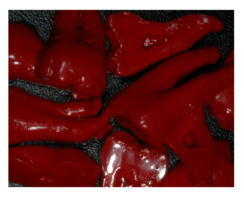
Figure 10.Application of two coats of red nail polish covering all the crowns of group 4