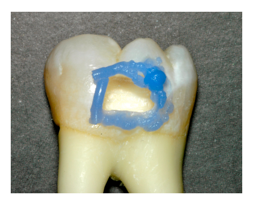
Figure2. Enamel conditioning with 37% orthophosphoric acid gel