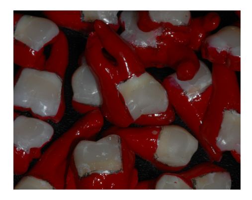
Figure 7.Application of two coats of red nail polish around restorations of group 1

All restorative procedures were performed by the same operator and all the specimens were stored in distilled water at 37°C for a period of 7 days. Afterwards they went through thermocycling 500 cycles between 5°C and 55°C with a dwell time of 30 seconds. Two coats of red nail polish (Resist and Shine L'Oréal, 16G901, Paris, France) were applied to the external surface around of each restoration of groups 1, 2 and 3 with 2 mm of margins (Figures 7, 8 and 9). The negative control group (group 4) was completely sealed (Figure 10). The specimens were submersed in a solution of <sup>99m</sup>Tc-Pertechnetate for 3 hours (Figure 11). After this period all varnish was removed with a bisturi (Figure 12) and the radioactivity was counted by a gamma camera.