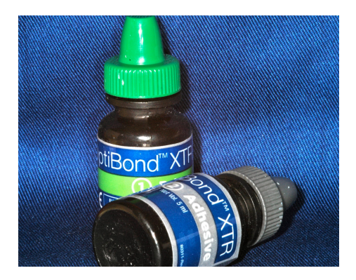
Figure 5. The self-etch adhesive OptiBond<sup>™</sup> XTR