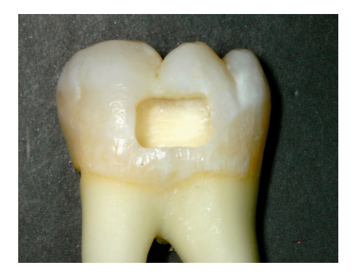
Figure 1.Class V cavity on the buccal surface