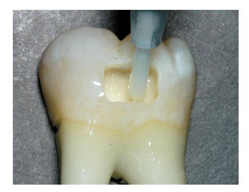
Figure 3.Application of a self-etch adhesive system