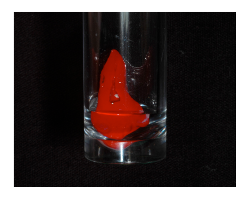
Figure 11.Immersion in a solution of <sup>99m</sup>Tc-Pertechnetate for 3 hours