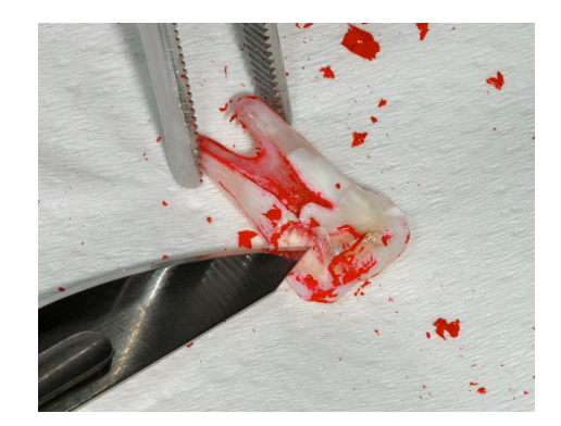
Figure 12. Preparation of the specimens for further evaluation in the gamma camera

The statistical analysis was made by using the program SPSS 20 and comparisons were done by nonparametric Kruskal-Wallis test with Bonferroni correction at a significance level of 5%.