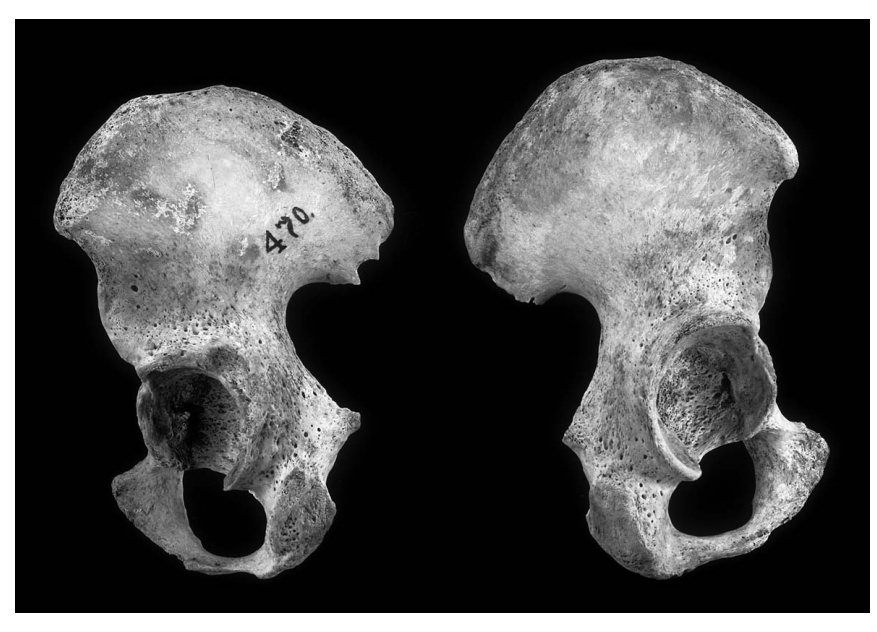
Figure 4. Left and right innominate bone in lateral view showing differences in the acetabulum morphology. The left bone exhibits a lesion that closed and constricted anterolaterally the hip joint, while the right one is wider and almost circular.

syndrome, trisomy 18, neurofibromatosis, osteogenesis imperfecta), so it appears that the kyphoscoliosis observed has an idiopathic origin. According to Ortner (2003: 397), "the vertebral bodies may have decreased height due to compression, often combined with a deeper scalloping of the endplate." This misalignment caused by kyphoscoliosis could