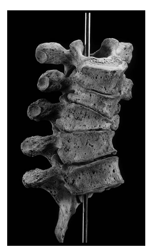
Figure 1. Abnormal curvature between the T2 and T6 vertebrae visible in an anterolateral view.

In the skull, the occipital condyles and the superior articular facets of the atlas have sharp edges. The articularis eminence near to the glenoid fossa shows a flat surface, with associated microporosity. However, no corresponding changes were seen in the mandibular condyles. At the external occipital protuberance, an asymmetrical superior curved line running downward from the left side is observed.