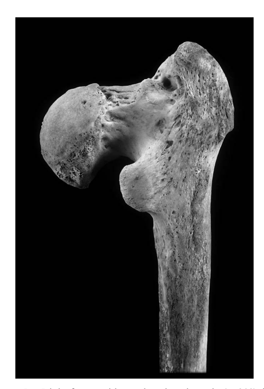
Figure 5. Right femur with a reduced neck angle (c. 90^{\circ} ) formed by the horizontal insertion of the femoral head in the collodiaphyseal axis is seen.

the femoral head, does not exhibit the typical signs of hip dislocation already described, namely its bilateral occurrence. Alternatively, a subcapital or transcervical neck fracture that occurred at early ages can be proposed as a possible diagnosis. This fracture, induced by acute trauma or accumulated stress, may have been responsible for a disruption of the bone supply to the femoral head, resulting in the tissue death (Ortner, 2003). This aseptic necrosis may underlie the detachment of the left femoral head and the formation of a new articulation in the innominate bone.