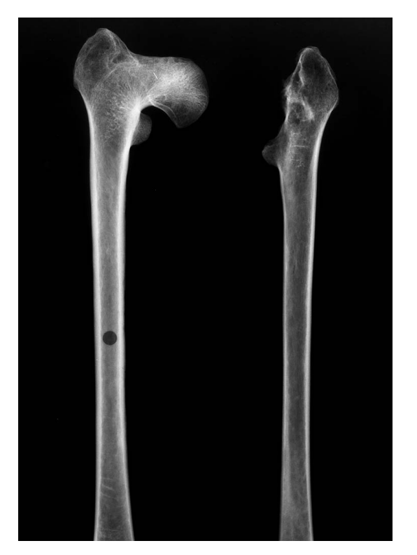
Figure 7. Radiographic image of both femurs, showing an increase radiopacity along the femoral shaft with increased thickness of the cortical bone and a reduced bony mass in the trochanters.

(Ortner, 2003; Brickley and Ives, 2008; Mays, 2008; Waldron, 2009; Brickley et al., 2010). Other features of RR includes kyphosis or scoliosis, changes in the morphology of the ribs and sternum, lateral narrowing of pelvis, abnormal shape of ilia, thickening in the concave face of long bones and mediolateral widening of proximal femora (Brickley et al., 2005; Brickley and Ives, 2008).