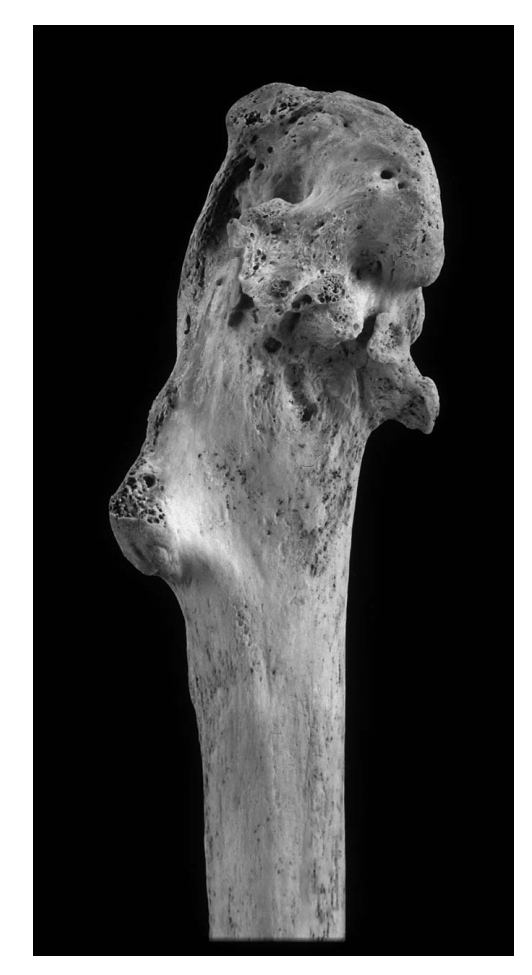
Figure 6. Left femur in medial view showing bone outgrowth.

For the right femur of Sk. 470 the differential diagnosis of the epiphyseal alterations observed included slipped femoral capital epiphysis (SFCE), Legg-Calvé-Perthes disease and congenital dislocation of the hip. The first condition is an adolescent hip disorder, characterized by a posteroinferior displacement of the femoral head in relation to the neck at the level of the growth plate (Szőke et al., 2009; Bullough, 2010), being more frequent in males and on the left side (Aufderheide and Rodríguez-Martín, 1998). Although certain similarities with SFCE exist, the forward orientation of the femoral head of Sk. 470, and the absence of the ligamentum teres depression, usually well defined in SFCE, allow us to exclude this condition. Legg-Calvé-Perthes disease, an avascular necrosis of the epiphyses (Shapiro, 2001; Ortner, 2003; Szőke et al., 2009), was also rejected since the femoral head does not present the typical 'mushroom-like' appearance, porosity, and exuberant bony growth that characterize this disorder (Aufderheide and Rodríguez-Martín, 1998; Ortner, 2003). A developmental pathology was also pondered to explain the congenital dislocation of the hip. This