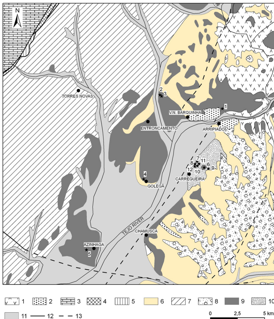
Fig. 2. Geological map of the study area with the samples sites. 1 – Gneisses; 2 – Granites; 3 – Jurassic (mainly limestones); 4 – Cretaceous (sandstones, marls and limestones); 5 – Paleogene (conglomerates, sandstones and clays); 6 – lower to middle Miocene (sandstones and clays); 7 – upper Miocene (limestones and marls); 8 – Pliocene (conglomerates and sandstones); 9 – Pleistocene (fluvial terraces); 10 – upper Pleistocene (aeolian sands); 11 – Holocene (alluvium); 12 – fault; 13 – probable fault.

although there is a tendency to systematically underestimate the given dose. We consider these results acceptable taking into account that it is at present unknown what the effect a \sim 10\% offset in dose recovery has on the D_e . Furthermore, the nature of bleaching light source used to remove the natural signal may have an effect on the dose recovery test; this is known to be true for quartz (Choi et al., in press) and one can expect the same to apply to feldspars.