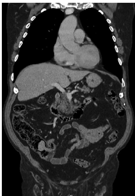
Fig. 1. Thoracoabdominopelvic CT scan (coronal section) with intravenous contrast showing a voluminous endoluminal polyp at the caecum measuring 40 × 31 mm with homogeneous enhancing. No alterations at surgical anastomosis level.