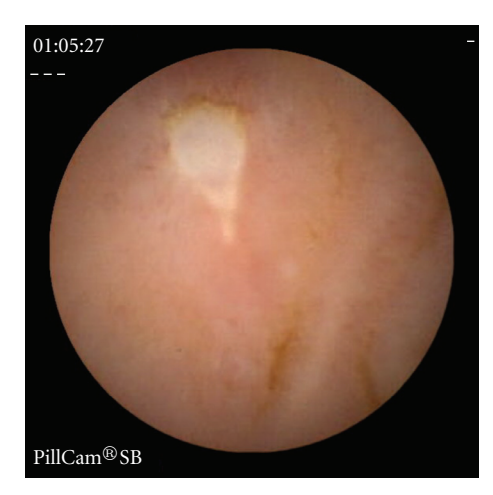
FIGURE 1: Jejunal ulcer.