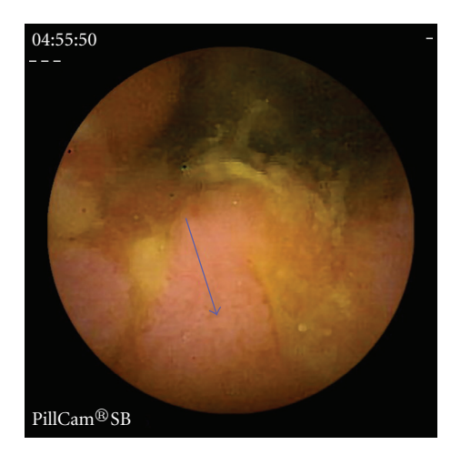
FIGURE 5: Area of villous atrophy in the ileo (arrow).

for an average of 13 months (4–24 months). Abdominal pain, weight loss, anaemia, and elevated CRP were present in all of them. The prior diagnostic work-up, that included colonoscopy with retrograde ileoscopy in three, SBT in four and CT in one, did not found any lesions. None of the four patients developed symptoms or signs of intestinal occlusion. Two patients underwent surgery involving the resection of a segment of the small intestine, and a histological study of the tissue showed aspects compatible with CD. The other two patients, who were twin brothers, were only given medical treatment and the capsule was expelled voluntarily.