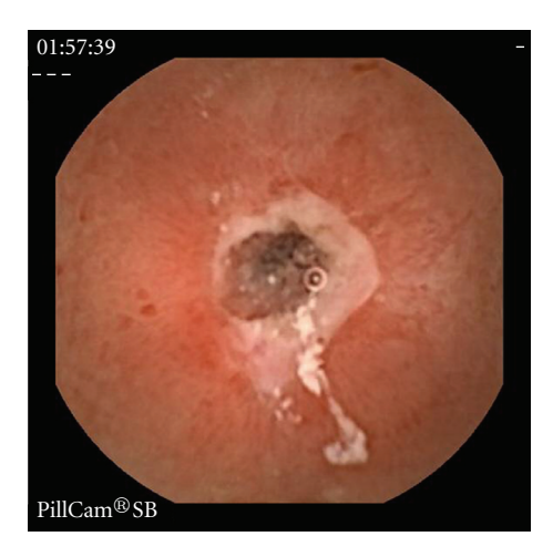
FIGURE 4: Jejunal ulcerated stenosis.