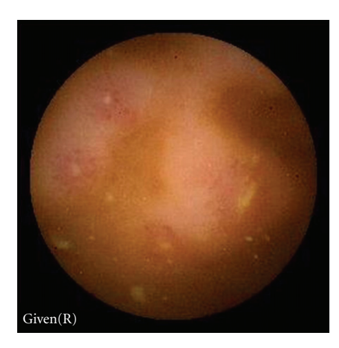
FIGURE 3: Ileal erosions.