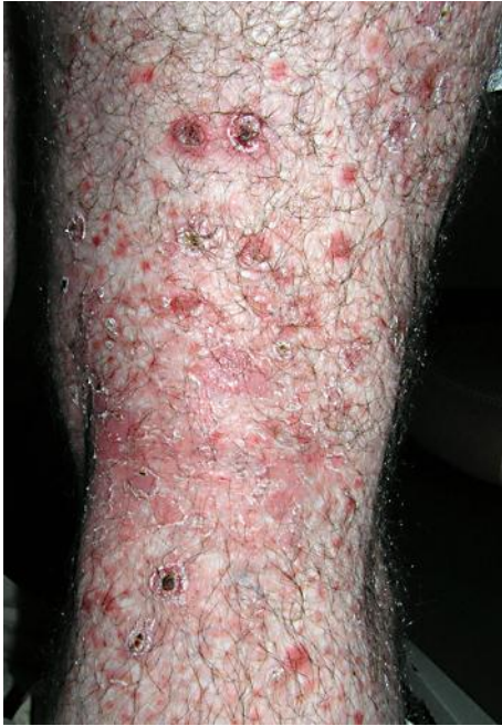
Fig. 1. Ulceronecrotic lesions with hemorrhagic crusts varying from 5 to 20 mm in diameter.