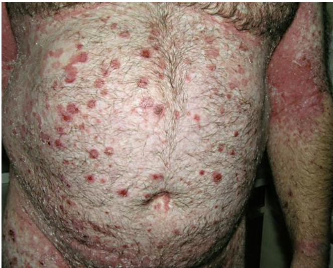
Fig. 2. Polymorphous clinical appearance of early lesions.