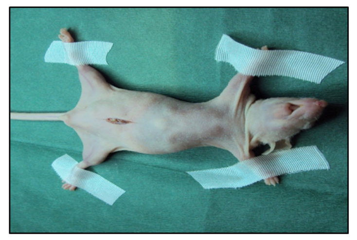
FIGURE 1 - Surgical technique. Abdomen was opened.

Colon diversion was performed with a proximal colostomy and distal fistula. First, the abdominal cavity was opened (Figure 1).