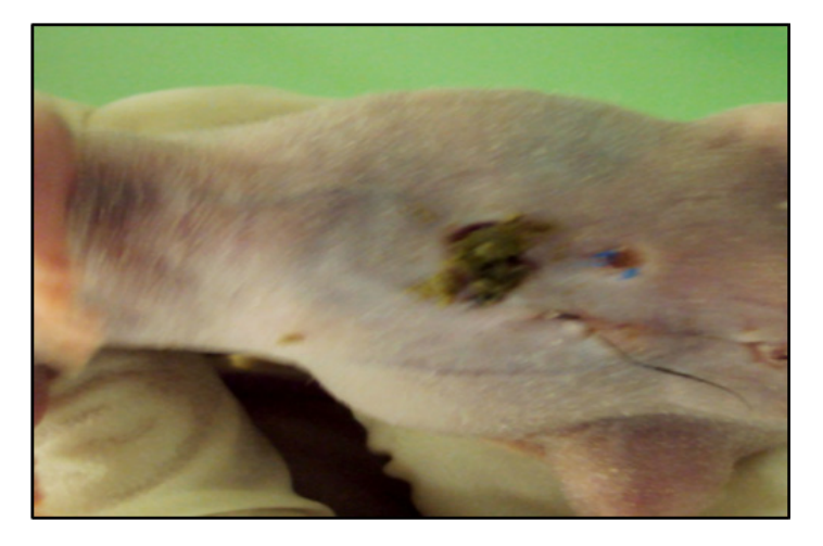
FIGURE 2- Surgical technique. Colon diversion and distal fistula was performed.

Then, two openings (2mm in length) were created in the left iliac region, all layers, lying about 10 mm from each other, in the craniocaudal line. The distal colon was identified. A colon section was made 20mm from the peritoneal reflection between mesentery vessels. The stoma was fixed to the wall by simple suture (Figure 2) to the edge of the incision in a circumferential manner located at the cardinal points using a 7-0 polypropylene thread and needle (cylindrical 8 mm circular 220 microns).