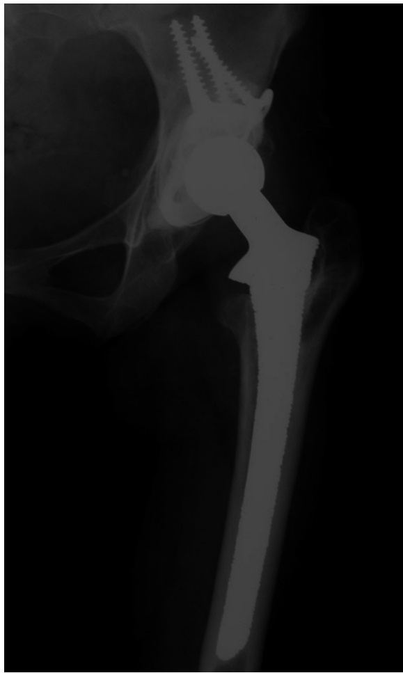
Fig. 2. Hip radiograph made 21 years after the Lord primary THA, showing a well-fixed Lord primary stem with signs of stress shielding of the proximal femur, and osteolysis of the great trochanter. At 9 years after the revision of the Lord primary acetabular cup, it was seen a stable fixation of the acetabular revision prosthesis.