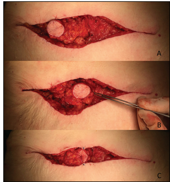
Figure 3: The island flap (A) was transferred to the desired position (B) and was fixed to the anterior sheath of the rectus abdominis muscle using a transfixive U stitch acquiring the intended conic shape (C).

This procedure was performed with the patient under general anesthesia. After performing wide excision with 2 cm margin of the melanoma, umbilical reconstruction and defect closure were planned [Figure 2]. Donor skin of the lateral margin of the defect was outlined to match the size and shape of the intended umbilicus. An island flap was designed such that the subcutaneous pedicle was long enough to be transferred to the planned site, setting the pivot point on the left lateral side of the flap. The island flap was successfully transferred to the desired position and was fixed to the anterior sheath of the rectus abdominis muscle using a transfixive U stitch at the center of the flap with a 2/0 absorbable suture (polyglactin 910). With this stitch, the flap acquired the intended conic shape recreating the umbilicus [Figure 3A-C]. The perimeter of the new umbilicus was sutured to the surrounding skin with 4/0 polypropylene. Meticulous placement of multiple subcutaneous sutures with 2.0 polyglactin 910 facilitated the approximation of the epidermis of the donor area without any tension. Epidermal approximation was obtained with surgical stainless steel staples [Figure 4A]. A pressure dressing was secured for 72h and then routine wound care advice was given to the patient. To prevent surgical site infection, the patient was given cefazolin 1000 mg ev before surgery and cefuroxime 500 mg bid po for 5 days