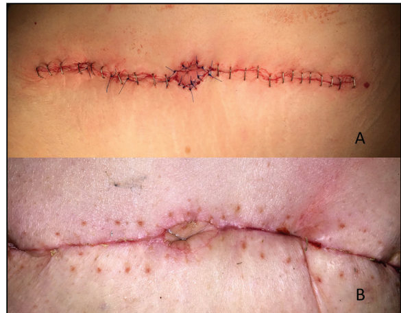
Figure 4: Final result immediately after surgery (A) and after removal of sutures 14 days after (B)

after. The patient returned 2 weeks later for suture removal [Figure 4B].