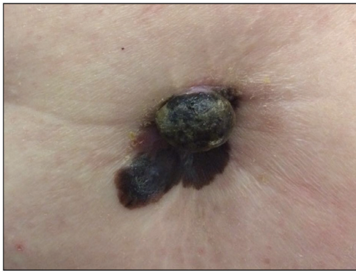
Figure 1: Nodular cutaneous melanoma, 5.6mm thick, enclosing the totality of umbilicus