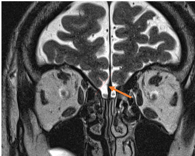
Fig. 1. Example of the implementation of olfactory sulcus (OS) depth measurement, in this case on the right side. It is performed using Osirix by first finding the plane of the posterior tangent through the eyeballs. Afterwards a virtual tangent to the inferior gyrus rectus and internal orbital gyrus is obtained. Using this line as a starting point, another one is then drawn to measure the OS. Both lines are represented in red in Osirix (see orange arrow). (For interpretation of the references to color in this figure legend, the reader is referred to the web version of this article.)

defined as the only ‘within-subjects factor’. Both age and estimated total intracranial volume were included as covariates. Despite age-matching, we still included age as a covariate because of the observed intragroup correlations (age × ROS, r = -0.289 , p = 0.020 ; Age × LOS r = -0.401 , p = 0.001 ).