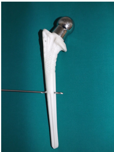
Fig. 3. The femoral component of the third-generation isoelastic RM® total hip replacement is easily perforated with a 3.2 mm drill due to their polymeric composition.