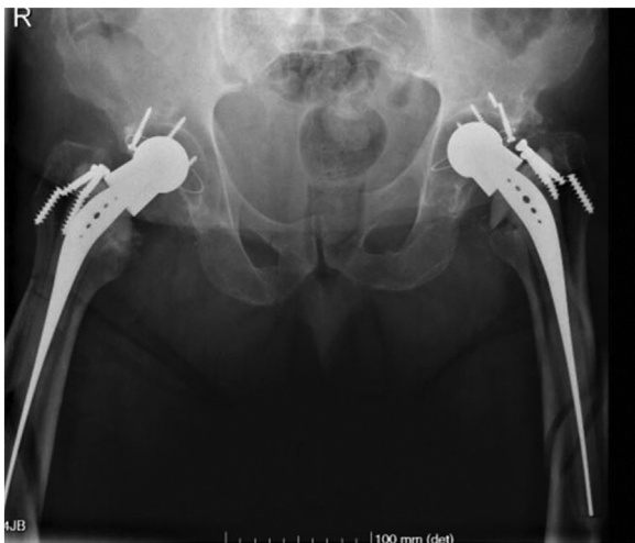
Fig. 1. Preoperative anteroposterior radiograph of the pelvis showing bilateral Vancouver type-B2 periprosthetic femoral fracture.

The purpose of this paper was to show the outcome of bilateral Vancouver type-B2 periprosthetic femoral fracture treated with open reduction and internal fixation, using a locking compression plate and bone allografts, in an older patient with multiple comorbidities.