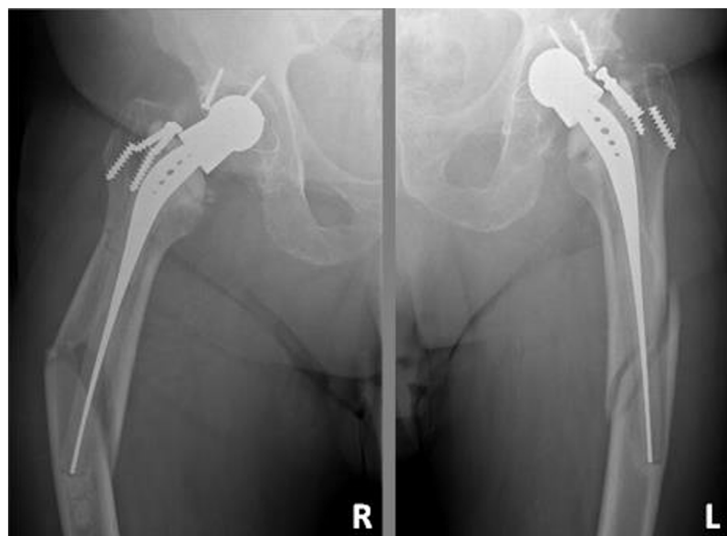
Fig. 2. Preoperative anteroposterior radiographs of the hips showing bilateral isoelastic prosthesis with osteolysis along the whole length of the femoral stem after 24 and 21 years in situ. Broken screws due to the prosthetic instability.

At 12-months follow-up, the patient presented an asymptomatic hips and expressed high degree of satisfaction with surgery result. He reported no pain in his thighs. The femoral radiograph showed consolidation of both fractures and the fibular structural allograft had no signs of bone resorption (Fig. 4). The patient was clinically able to walk without external support.