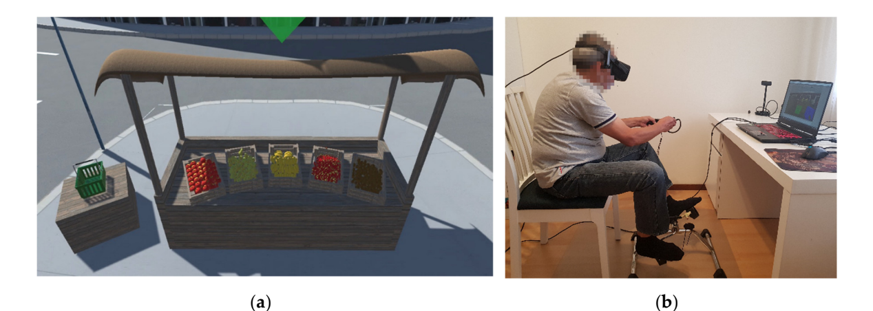
Figure 1. (a) Example of a task in the virtual city; (b) Example of using the application.

The sit-down pedal that can be seen in Figure 1b, is a traditional piece of low-cost rehabilitation equipment and is recommended by occupational and physical therapists for patients' home use in order to keep their legs active while watching television, for example. One of our decisions for our design was to use some universal and low-cost equipment—in the present case, the pedal system—integrated with VR to increase motivation in its use, combining physical exercise with cognitive stimulation, which is crucial to reduce cognitive decline and prevent dementia. The decision to target this device was based on its price, portability, usability and safety. The rejection of the treadmill and option for the pedal was based on the inadequacy of the former for many potential users due to physical limitations related to the ageing process and safety concerns, whereas the sit-pedal is usable and safe for most of them. Furthermore, the similarity of a sit-down pedal to riding a bicycle can elicit memories and skills associated with a familiar vehicle for leisure or for transportation while ensuring the individual's safety.