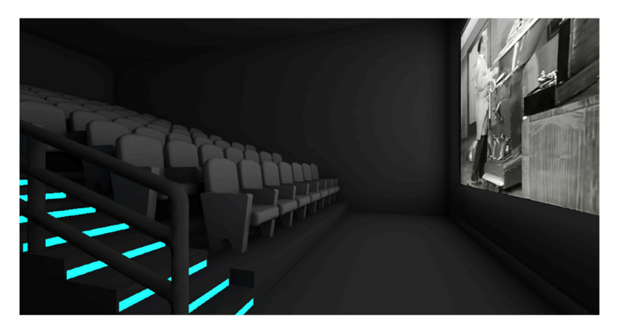
Figure 2. Example of the movie theater.

For cognitive stimulation, other tasks are also implemented, such as shopping for fruit or going to the cinema (see Figure 2). In the shopping task, the user is requested to buy a specific amount of fruit of different types. Therefore, he/she has to select the fruit, pick it up and buy it as he/she used to do in a real shop. To accomplish these tasks, he/she uses the touch controllers associated with the HMD to track the hand position and to represent them in the virtual world. This allows the user to interact with the virtual world like in the real world, also forcing him/her to perform physical activity using the upper body limbs. Going to the movies might also help to create memory stimulation. Since the target population of the study was a group of senior citizens, old movies were used in this version of the application.