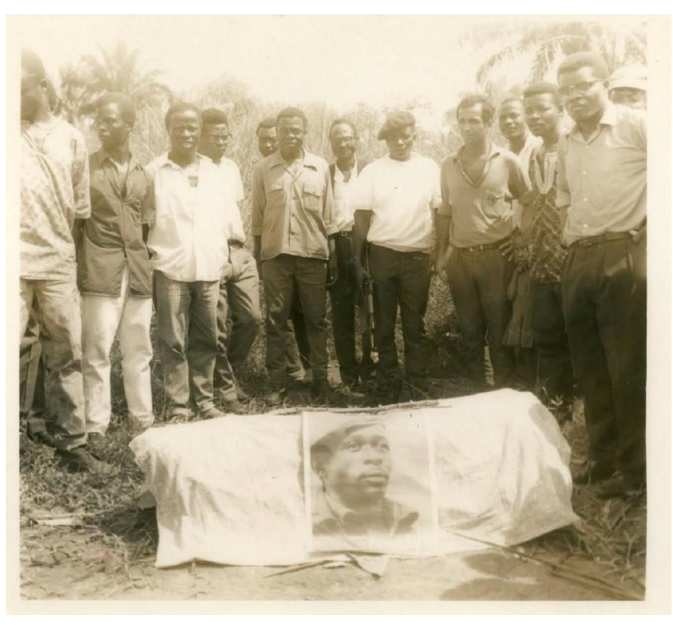
Fig. 1. Funeral of Hoji ya Henda in Cabinda, 1970, with an empty coffin.

Mbeto Traça, a general in the Angolan Armed Forces who fought in the liberation struggle, writes that the MPLA was never very efficient in honouring its heroes during the liberation struggle. That was not the case with Hoji ya Henda. Henda was considered and honoured as a hero by both MPLA leaders and his comrades in arms even before the independence of Angola, and would become a national reference afterwards. For the MPLA, his example proved to be a powerful political weapon at a time it was not yet in control of the state mechanisms that allowed a more robust and perennial diffusion of memory. The invocation of heroes has utilitarian purposes. Nation states regularly instrumentalise the actions and feats of heroes to set the tone and narrative needed during a particular period. Hoji ya Henda was already