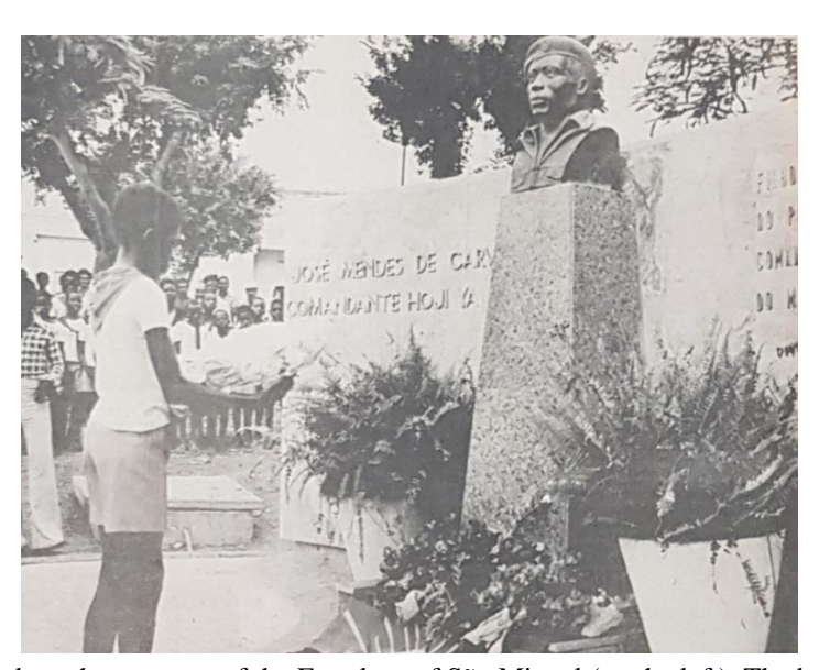
Figs. 3 and 4. Bust of Hoji ya Henda at the entrance of the Fortaleza of São Miguel (on the left). The bust was previously part of a monument to Henda in front of the Ministry of Defence (on the right).