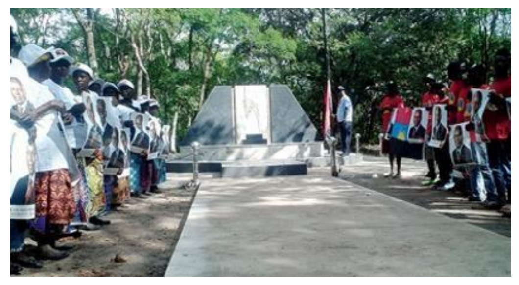
Fig. 5. Inauguration ceremony of the tomb of Hoji ya Henda completed in 2015, with people holding JMPLA flags and photographs of José Eduardo dos Santos.

heroes. A tomb was erected with the support of the MPLA's Provincial Committee in Moxico in partnership with the National Secretariat of the JMPLA (Fig. 5).<sup>53</sup>