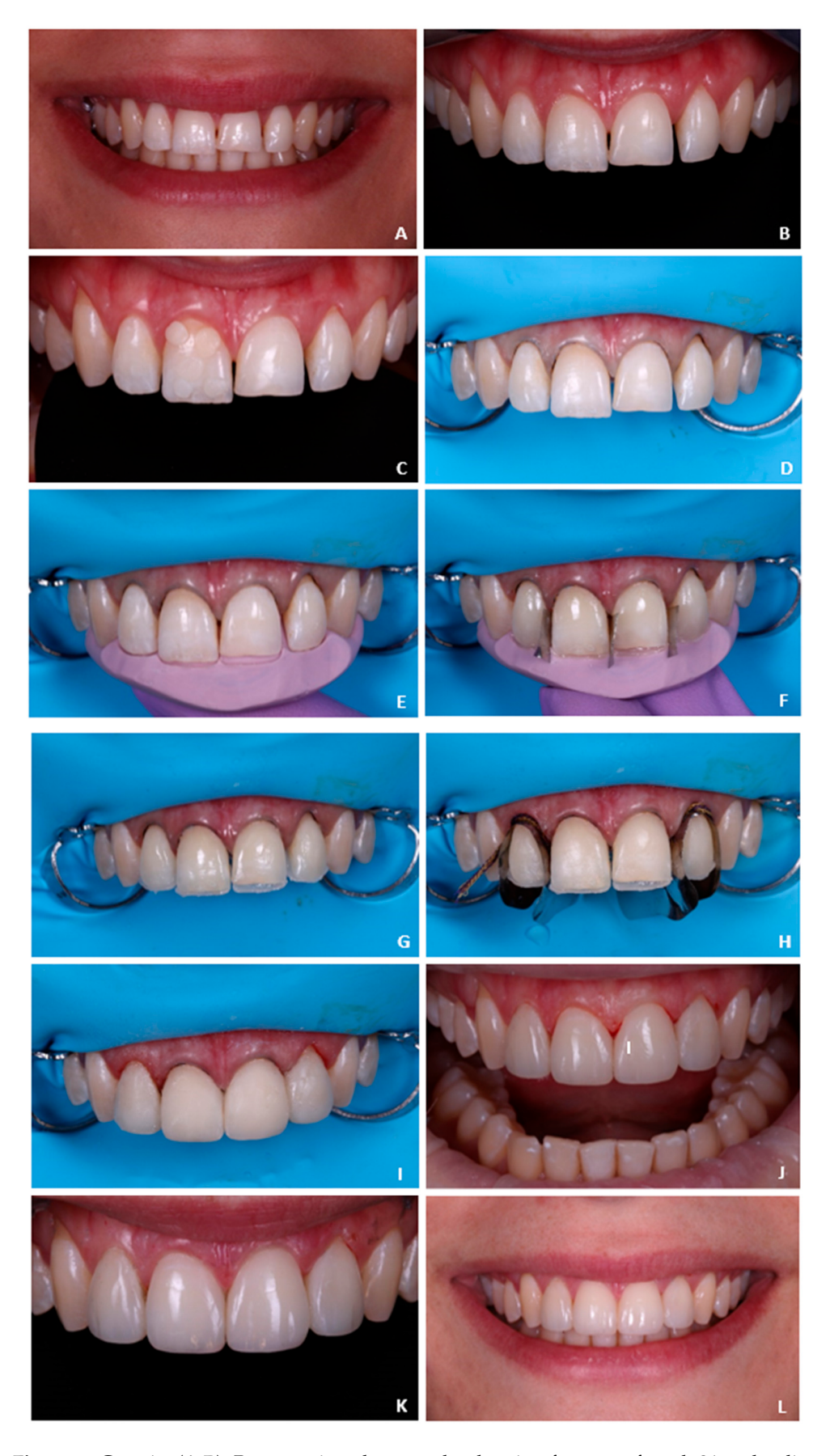
Figure 1. Case 1—( A , B ): Preoperative photographs showing fracture of tooth 21 and a diastema between tooth 22 and tooth 21. ( C ): Color-choosing process was performed through the "button try"