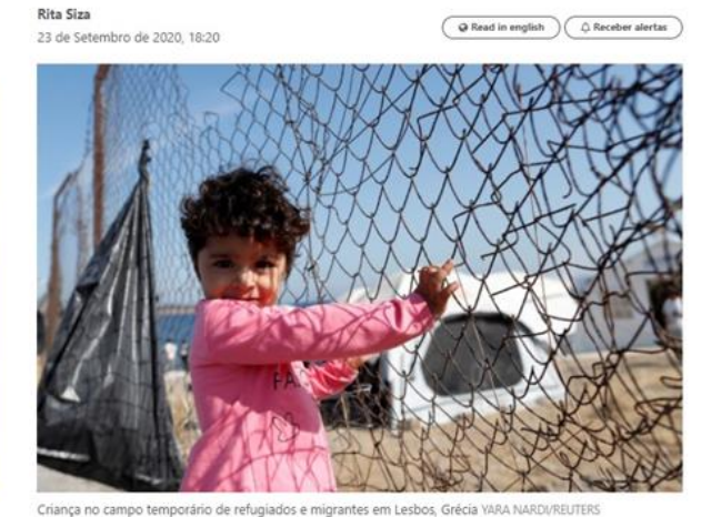
Figure 3.8. Screenshot of PUB20200923A (left) and PUB20200923B (right).

Ao abrigo do novo "mecanismo de solidariedade", os Estados-membros tanto podem receber dinheiro para acolher refugiados, como pagar para patrocinar o regresso de migrantes aos países de origem.