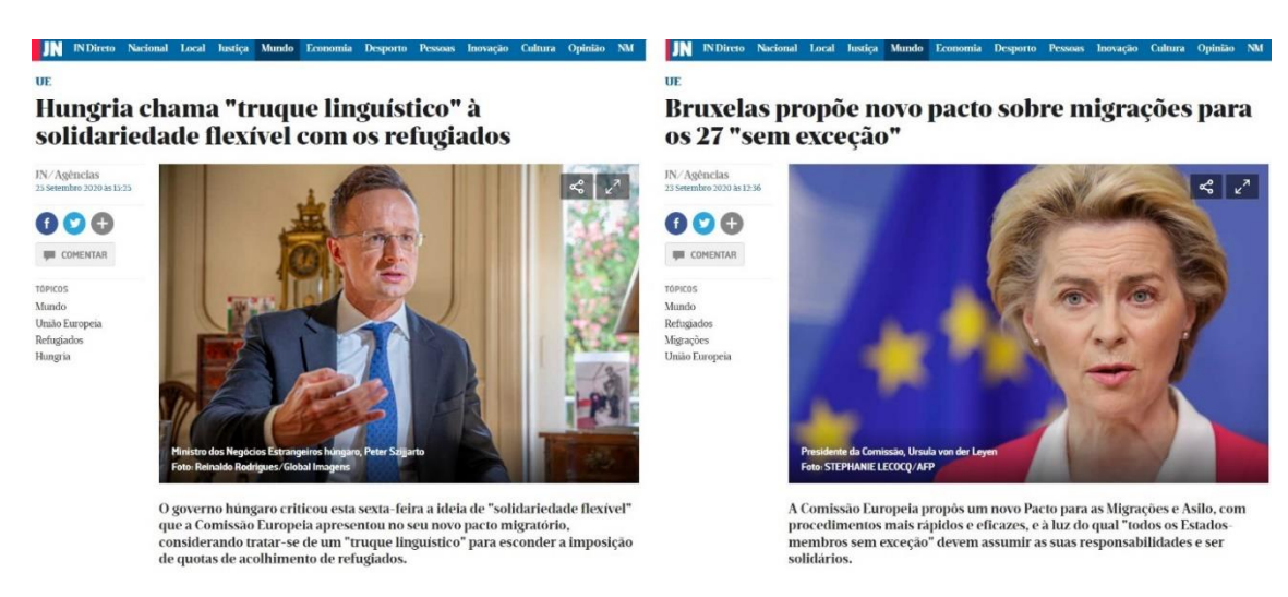
Figure 10. Screenshot of items JN20200923 (left) and JN20200923 (right).

Minister of Foreign Affairs Peter Szijjarto gesturing, in a neutral context, and refers to his protest over expected "obligatory quotas of reception" by informing that he "insisted on his ultranationalist government's stance that to defend the EU borders is 'also a form of solidarity" —supposedly what Hungary has been doing by preventing migrants from crossing to other EU countries. By contrast, Von der Leyen appears in an earlier report with a stern face expression, against the background of an EU flag, quoted saying that the Pact introduces "faster and more efficient procedures" through which "all member-states, 'with no exception'", must "take responsibility and show solidarity" (JN20200923).