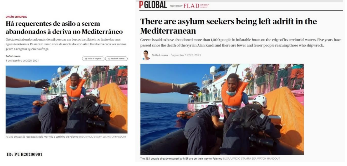
Figure 3.6. Screenshot of PUB20200901.

feature picture shows migrant persons rescued by MSF and the deck accuses Greece of having abandoned over 1,000 people that shipwrecked.<sup>35</sup>