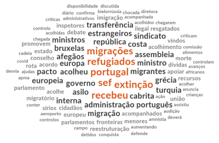
Figure 3.2. NVIVO-generated word cloud of titles (CM).

The latter formulation appears in the titles of 16 items, meaning that Portugal appears as willing to welcome refugees —being able to host more or having done so already, in which case the number of refugees is informed—in the titles of 10% of the sample's news reports. Other frequent words include the surnames of authorities —Costa, the Prime Minister, MHA Cabrita, and other official instances, such as the Ministry or the Parliament, besides Brussels, Greece, Turkey, Pact, European, and other words bound to appear in research with the topic and scope chosen for the present one, since they represent the city where the EC is based, the countries most often associated with the transit of people into the EU, and so forth.