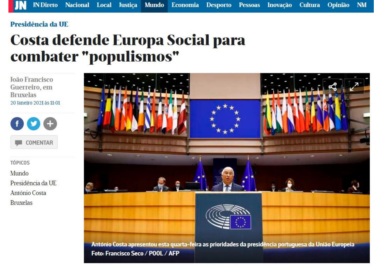
Figure 3.11. Screenshot of JN20210120.

Costa speaking on the EP's floor, surrounded by EU and national flags. Hence, besides appearing as supportive of the EC's initiatives, Portugal is also portrayed as proactively attempting to help the EU member-states to achieve the necessary consensus for adopting a common approach.