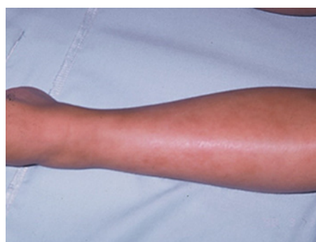
Fig. 2. Racemosa livido reticularis.

At the end of the seventh year of life, she began a prolonged fever syndrome (PFS) for 95 days, abdominal pain, hepatomegaly, splenomegaly, polyarthralgias, livido racemosa (Fig. 2), and ocular episcleritis. Laboratory tests described in Figure 1 revealed a worsening hemoglobin of 8.5 g/dL, high ESR 115 mm/h, and CRP 20.5 mg/dL. All etiological investigation for infectious prolonged fever was negative; the serum angiotensin converting enzyme (SACE) antineutrophil cytoplasmic antibody was normal or negative; human leukocyte antigen (HLA) class 1 molecule B27 (HLA-B27) was positive; complement C3, C4, and CH50 were normal. One year later, due to a protracted pneumonia, a chest computed tomography was performed that revealed “subsegmental collapse in the middle lobe with incipient cylindrical bronchiectasis and multiple enlarged mesenteric and para-aortic ganglia.” Immunodeficiency investigations disclosed decreased chemotactic activity of neutrophils and deficit of CD15 expression in leukocytes, and studies of phagocytosis and respiratory explosion of granulocytes and monocytes did not show any changes. Serum immunoglobulin concentrations disclosed low IgG (4.6 g/L [N 5.6–13.8]) and IgM levels (0.3 g/L [N 0.47–2.0]) but normal IgA levels (1.0 g/L [N 0.24–2.32]).