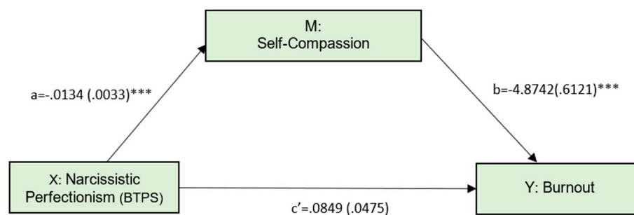
Figure 3. Simple mediation model, with narcissistic perfectionism as the predictor. Numbers represent unstandardized coefficients. Numbers in parentheses represent standard errors. *** p < 0.001 .

The third model, shown in Figure 3, tested whether self-compassion would mediate the relationship between narcissistic perfectionism and burnout (Figure 3).