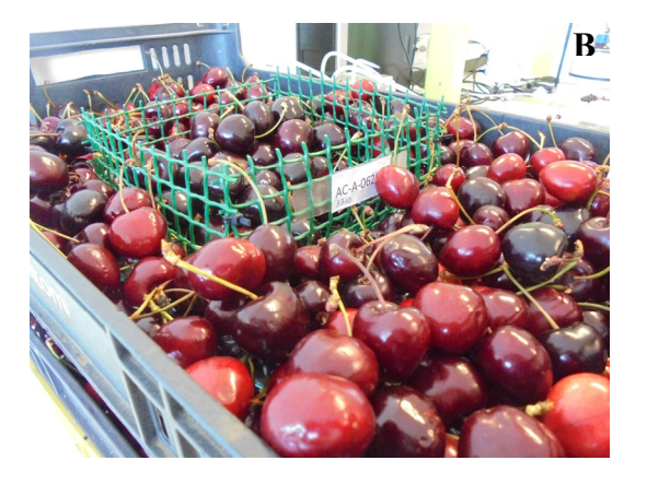
Figure 1. Sweet cherries cv. Satin numbering ( A ) and netted basket with the numbered sweet cherries placed in the centre of a 5 kg commercial tray ( B ).