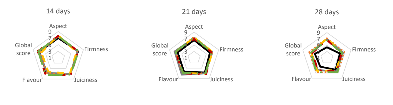
Figure 5. Results from the sensory evaluation of sweet cherries cv. Satin in 2020 after 14 days, 21 days and 28 days. The evaluation followed a 9-point scale ranging from 1 (dislike extremely) to 9 (like extremely). Treatment 1 was located at FO under normal atmosphere conditions. Treatments 2 to 6 were located at RC. Treatment 2 was under normal atmosphere conditions. The atmosphere compositions of treatments 3 to 6 were 3\%O_2-10\%CO_2 , 3\%O_2-15\%CO_2 , 10\%O_2-10\%CO_2 and 10\%O_2-15\%CO_2 , respectively.

The influence of atmosphere composition in sweet cherry sensory characteristics, more precisely, in flavour, appear to be variable across different cultivars. Wang and Vestrheim [34] reported that atmosphere composition did not significantly influence the flavour of cv. Van, Sam and Stella. Nevertheless, according to the same authors, cv. Kristin, Huldra and Emperor Francis showed higher flavour scores under CA conditions.