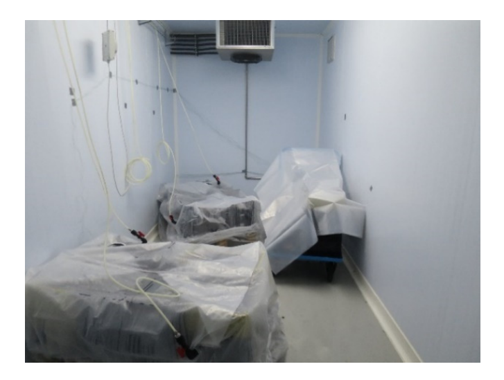
Figure 2. LDPE plastic bag cover of controlled atmosphere treatments and connection to the GAC 5000 unit for gas monitoring and control.