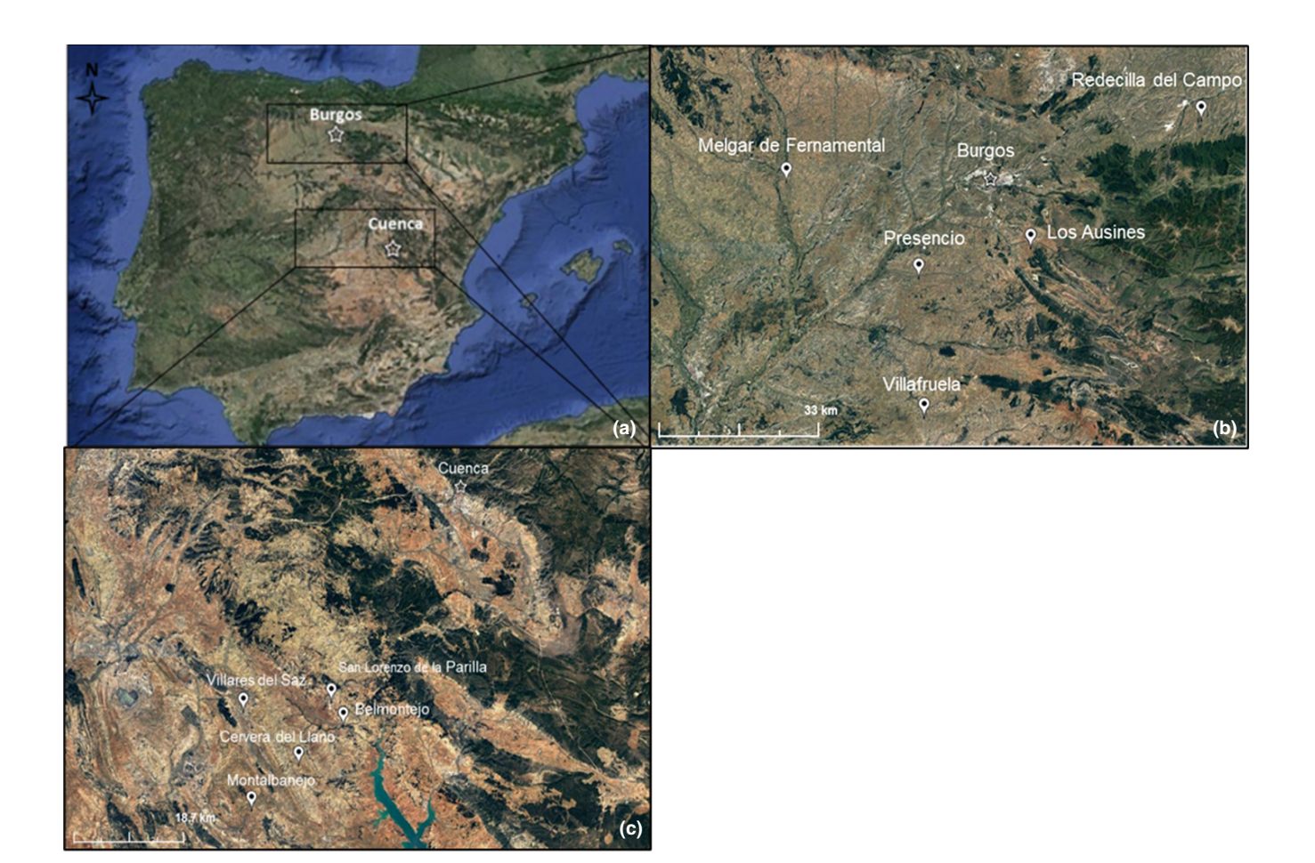
FIGURE 1 Aerial images of the sampling regions: (a) location of Burgos and Cuenca regions; (b) municipalities sampled in Burgos and (c) municipalities sampled in Cuenca.

In Cuenca, although the landscape is intensively used for agriculture (Table S2), it is also marked by the presence of frequent