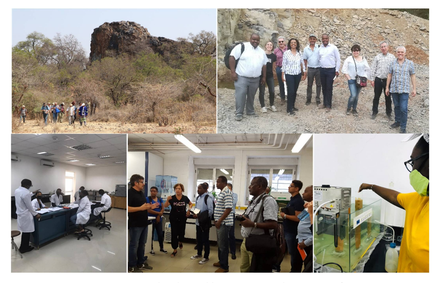
Figure 2. Geological survey, laboratory activities and team meetings of SUGERE project.

One of SUGERE's main objectives is to provide support in setting up and preparing research and teaching laboratories in the African institutions participating in the project. Setting up a laboratory not only involves the purchase of equipment and materials (which this project finances) but also the training of personnel who know how to use the equipment and interpret the results correctly (Figure 2).