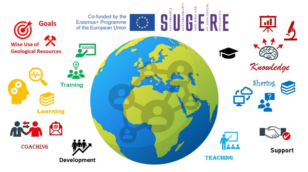
Figure 1. SUGERE (Sustainable sustainability and Wise Use of Geological Resources).

SUGERE [91] (Sustainable sustainability and Wise Use of Geological Resources) is an ERASMUS+ project (Figure 1. KA2—Cooperation for innovation and the exchange of good practices—Capacity building in the field of Higher Education). The consortium includes four partners from three European countries (University of Coimbra and Centro de Estudos Sociais—Portugal; Univrsity of Salamanca—Spain; University of Torino—Italy) and six partners from three African countries (Universidade de Cabo Verde and Universidade de Santiago—Cabo Verde; Universidade Agostinho Neto and Instituto Superior Politécnico Tundavala—Angola; Universidade Eduardo Mondlane and Instituto Superior de Ciências e Tecnologia de Moçambique—Mozambique). It started on 15 January 2019 and it will last until 14 September 2023 (extended from the original deadline due to the COVID-19 pandemic crisis).