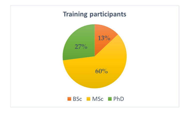
Figure 3. Education of the training participants.

All project and teaching documentation were stored on a computer platform (My-Cloud) so that it could be shared among all SUGERE project partners. Due to COVID-19 pandemic restrictions, it has not been possible to carry out the educational trips so far; thus, some of the activities that should have taken place in presence have been transformed into synchronous (and asynchronous) lessons. Staff from the Universities of Salamanca, Torino, and Coimbra transformed the planned lectures described in the SUGERE proposal into online synchronous lectures for students, starting with PhD students from the University of Angola (Table 3).